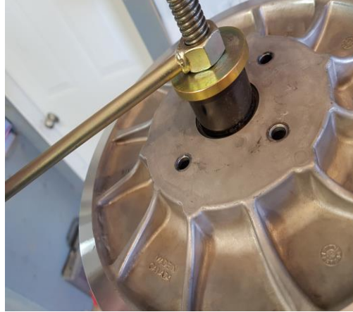
Compressor tool for helix bolt removal

Use holding tool. Remove the secondary pulley (rear clutch) by removing the center bolt.